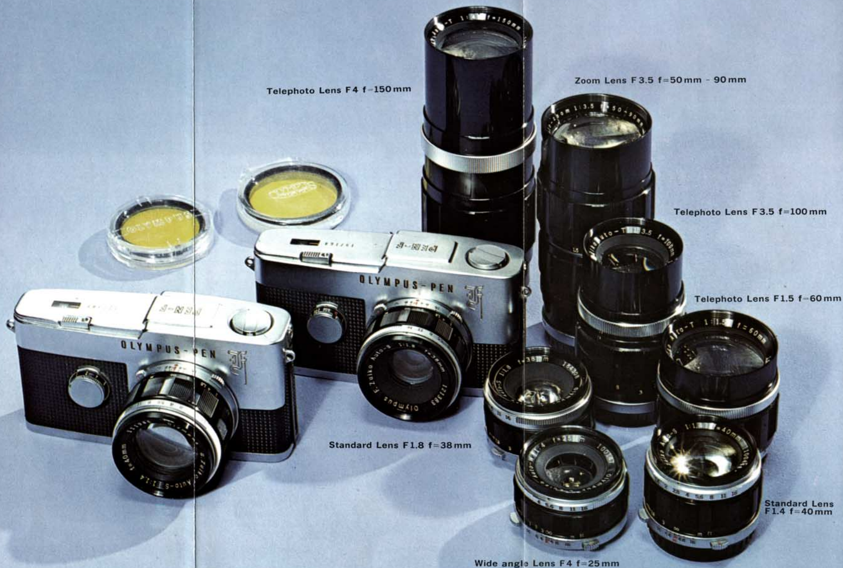
Telephoto Lens F4 f=150mm