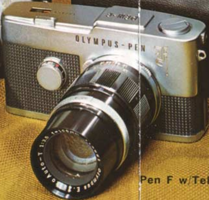
Pen F w/Telephoto 100mm Lens

ENRICHED RANGE OF INTERCHANGEABLE LENSES FOR Olympus Pen F