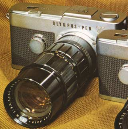
Pen F w/Zoom Lens