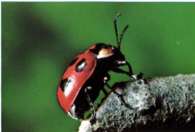
● Extension Ring Set