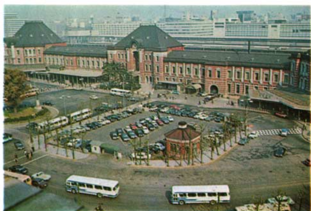
● F Zuiko Auto S F/1.8, 38mm

Variety of accessories.....to fully meet the requirements of the users and widen the versatility of the Pen F.