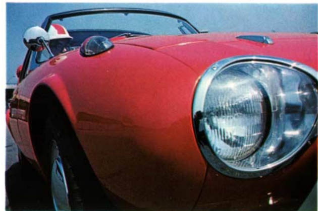
● E Zuiko Auto W F/4.0, 25mm